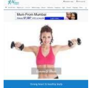
Exercise & fitness