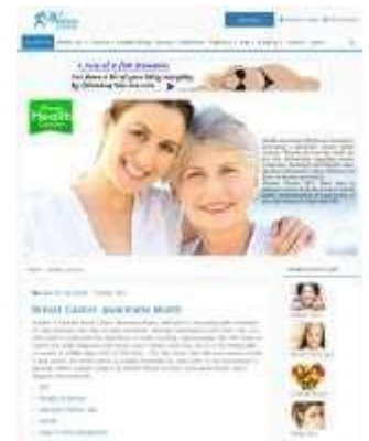
Women Health Concern