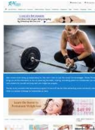
Women Body Building