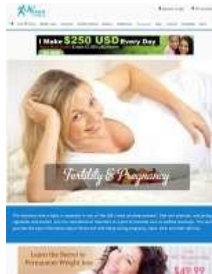
Fertility & Pregnancy