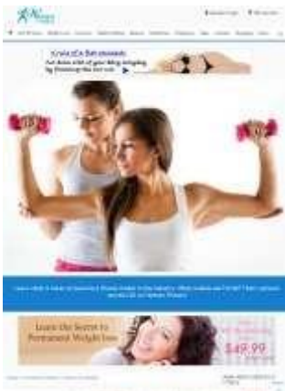
Fitness for Models