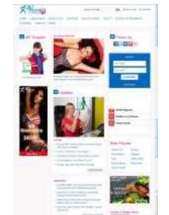
Country Specific Editions